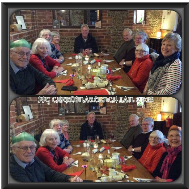
In January Ten members of the PPG enjoyed a post Christmas lunch at the Railway Tavern Framingham Earl